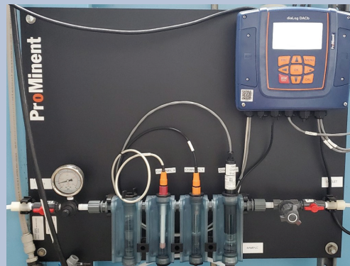
New Prominent Chlorine Analyzer replaced older failed and discontinued analyzer equipment

The Chlorine Analyzer on Treatment Plant 2 stopped working during the Caldor Fire recovery and the equipment model had been discontinued. This equipment provides real-time chlorine analysis to optimize the disinfection process for our water treatment operators. Replacement equipment was purchased and installed by staff for approximately $12,000.