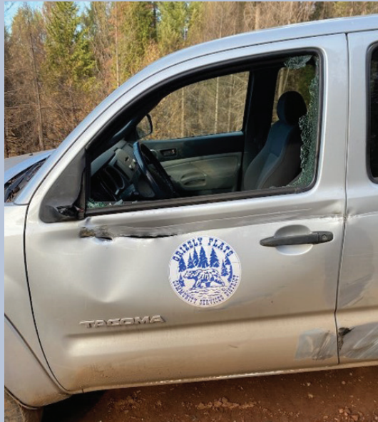
District's Toyota Tacoma Service Truck Damage

Every year, the Grizzly Flats Community Services District implements numerous projects and programs to deliver safe, pure, clean water to your faucet. Here is a summary of some of the projects the District has recently completed or have planned for the near future for the District's water system: