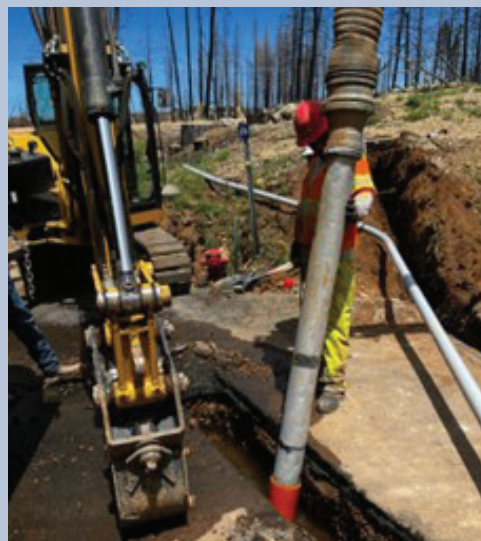
PG&E Undergrounding Electric Utility Efforts